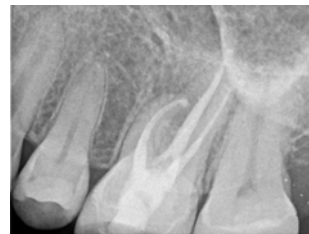
(Figure 1) Digital image taken 5/6/08