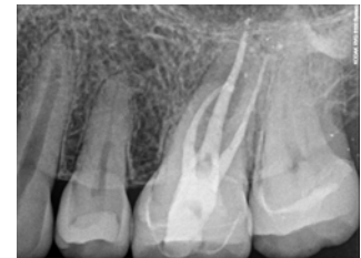
(Figure 2) Digital image taken 3/26/09

retreatment cases. A panoramic and 3D image were taken. (Figure 3). A single slice of one of the 3D images shows a significant lesion of endodontic origin in each plane of section axial, coronal, and sagittal. What appears to be vague on a digital periapical image is clearly significant with 3D imaging technology. The advantages of using 3D imaging technology for endodontic diagnosis cannot and should not be overlooked.