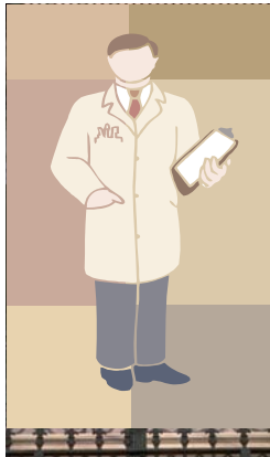
“The survey emphasized the importance of frequent, personal interaction and communication between general dentists and endodontists”

“The AAE is dedicated to excellence in the art and science of endodontics and to the highest standard of patient care.”